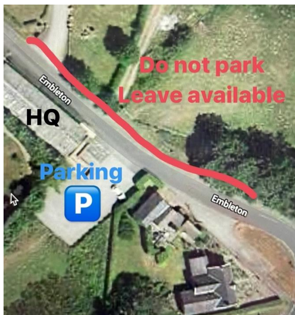
HQ – Parking

Please note Parking at the HQ is limited. Please do not park on the road outside the HQ and leave this available as a drop off area for people to sign ON/OFF prior to parking permanently elsewhere. Parking is available near the start at Beck Wythop, Thornthwaite road and also the road alongside Dubwath Meadows Nature Reserve.