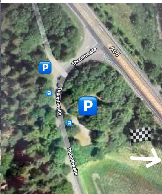
Parking Near Start (beck Wythop) And finish (Thornthwaite rd). Please take note of Reg's (5,6,10 & 17)

(Parking instructions courtesy of Ken Brown, VC Cumbria)