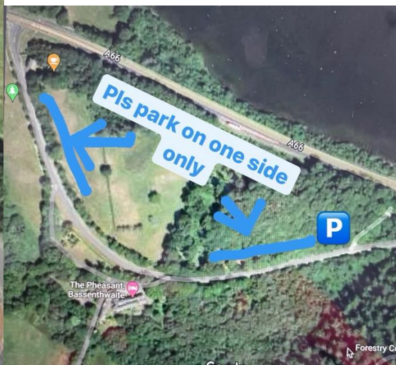
Old road to Pheasant inn (Dubwath). Only park one side and at either end of the road, not by Pheasant inn