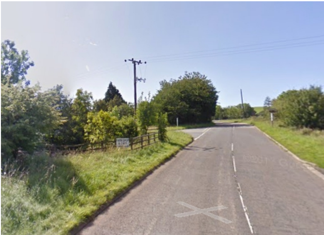
Left to head to farm shop