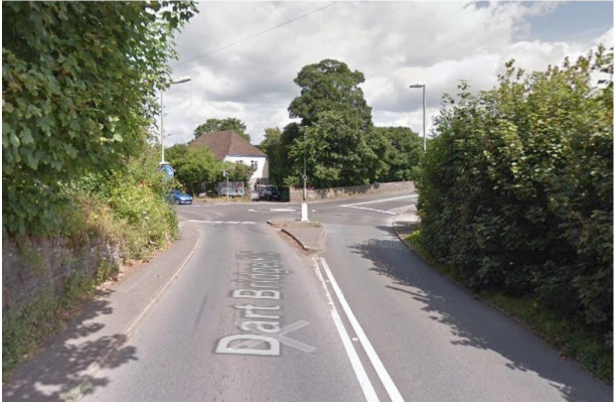
Roundabout 2 nd Exit