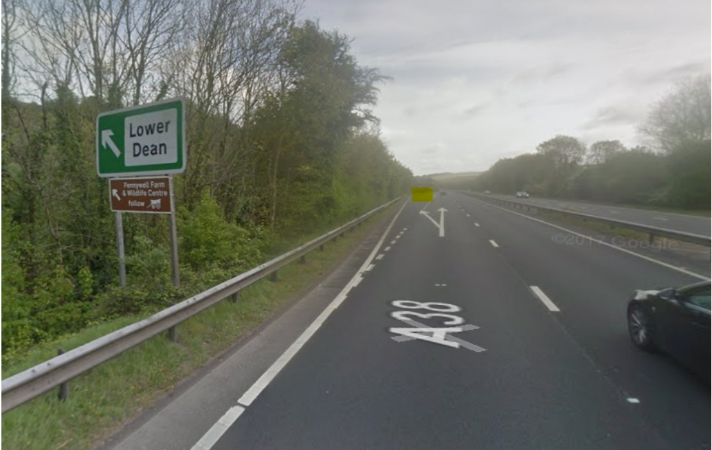
Off A38 at Lower Dean