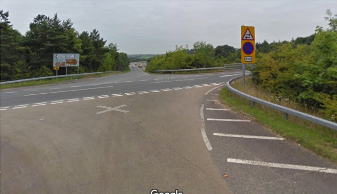
Turn 3 – Right