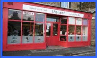
THE LOAF BAKERY