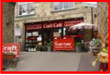
HELEN AND ALAN CHERRY CHERRY'S CAFÉ MATLOCK BATH