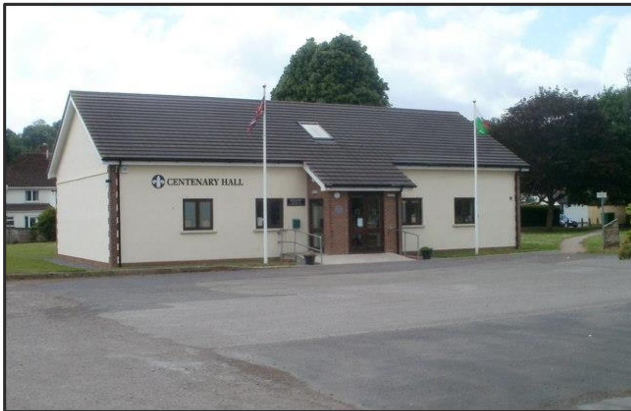
Usk Centenary Hall, Maryport Street, NP15 1AD

To the riders and their families attending our final time trial event of 2024, thank you for your support and we hope you enjoy your time with us on Sunday. Our headquarters for the event is at Usk Centenary Hall (also known as Usk Scout Hall), which is little more than a mile from the start line for the R25/7 course.